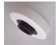
sensor without cap