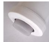
sensor with protection cap

Screwing the cap on the sensor during storage increases sensor lifetime.